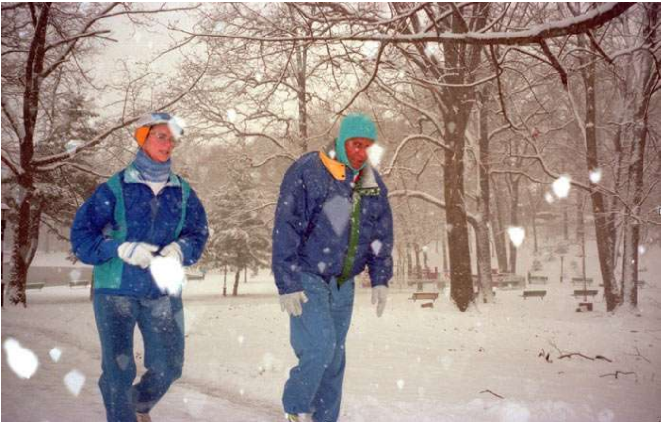
Guru with Nishtha at 2-Mile Race

The photos of Guru running in this article are from his participation in three 2-mile races in Goose Pond Park—two in 1995 and one in 1996. There are two seasons represented in these races: fall (including a snowfall in one of the races) and winter. On the Sri Chinmoy Reflections site it is recorded that Guru ran 3 official 2-mile races in the park between 1995 and 1996: 2 December 1995, 9 December 1995 and 10 February 1996. The December races were before we took off on our Christmas Trip to South Africa and the last race was when we returned.