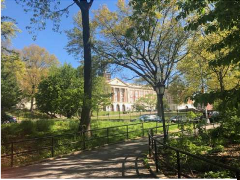
Jamaica High School as seen from Goose Pond Park