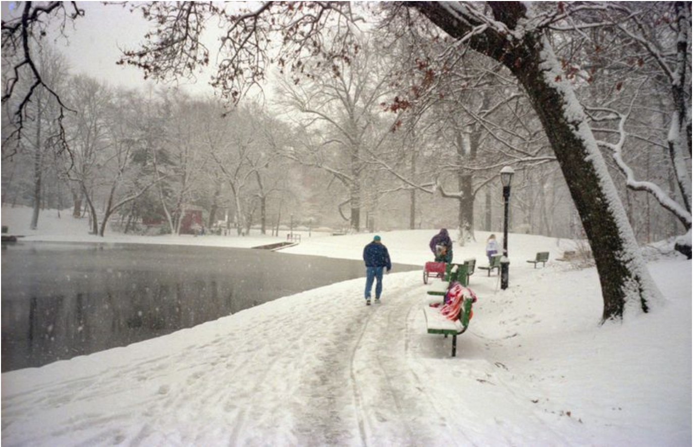
Figure 3 Guru running in the snow by the lake, with videographer on tricycle!

remaining Christmas Trips, but the 10 February race would remain his fastest time for those remaining races.