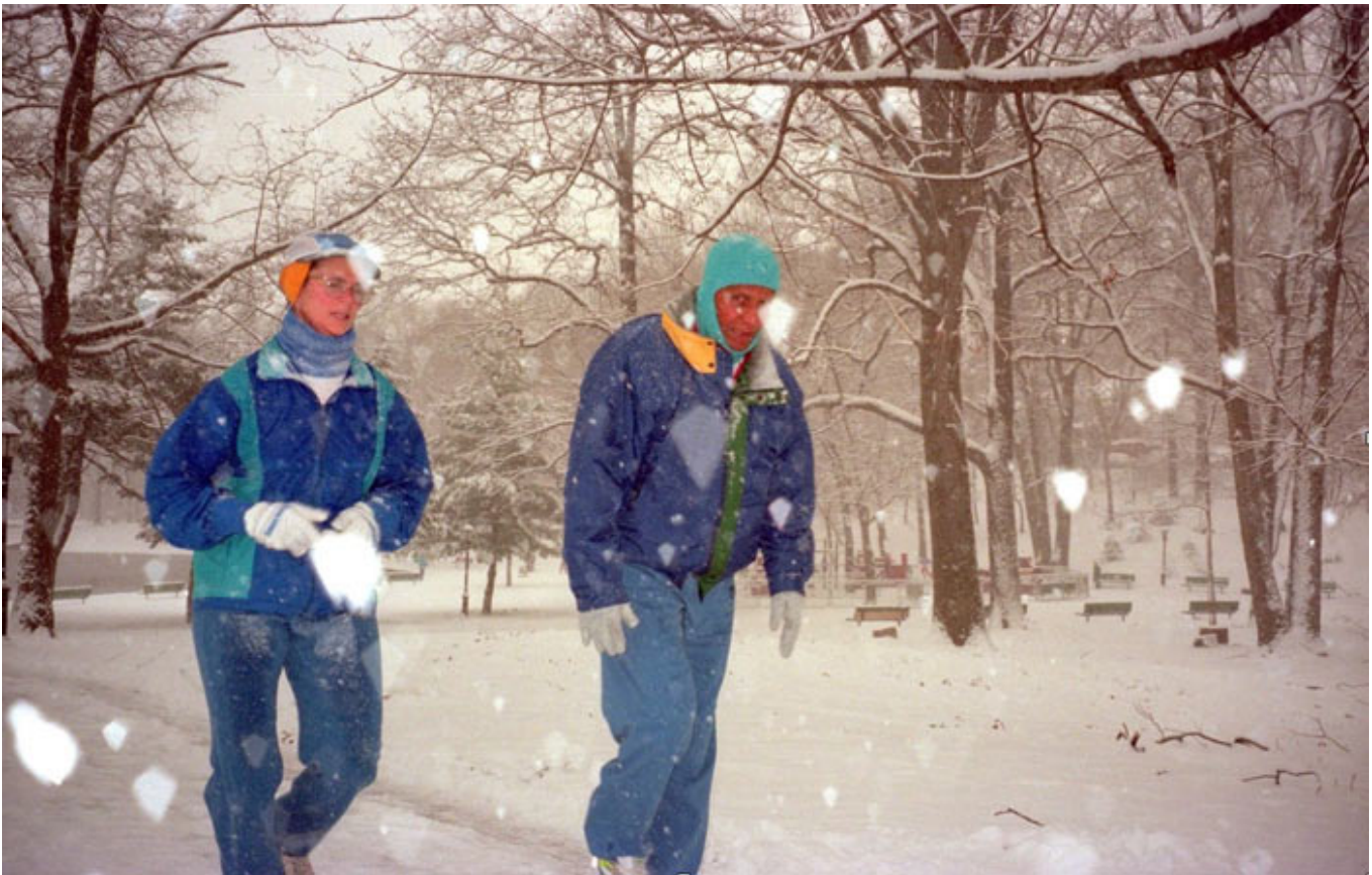
Figure 2 Guru with Nishtha at 2-Mile Race

The photos of Guru running in this article are from his participation in three 2-mile races in Goose Pond Park—two in 1995 and one in 1996. There are two seasons represented in these races: fall (including a snowfall in one of the races) and winter. On the Sri Chinmoy Reflections site it is recorded that Guru ran 3 official 2-mile races in the park between 1995 and 1996: 2 December 1995, 9 December 1995 and 10 February 1996. The December races were before we took off on our Christmas Trip to South Africa and the last race was when we returned.