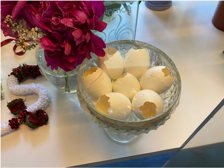
Figure 6 Photo of eggs eaten by Guru, still on display in Annam Braham Restaurant

“For many Saturdays until March 2, 1996, Guru would invite us to Annam Brahma after the 2-mile race in Goose Pond Park. Even though the restaurant was not usually open for breakfast, Guru requested the workers to cook for us and have special breakfast with him. Many times Guru would get the prasad for us himself, and sometimes he would go right next door and buy it at the deli.