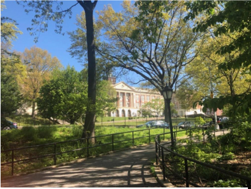
Figure 5 Jamaica High School as seen from Goose Pond Park