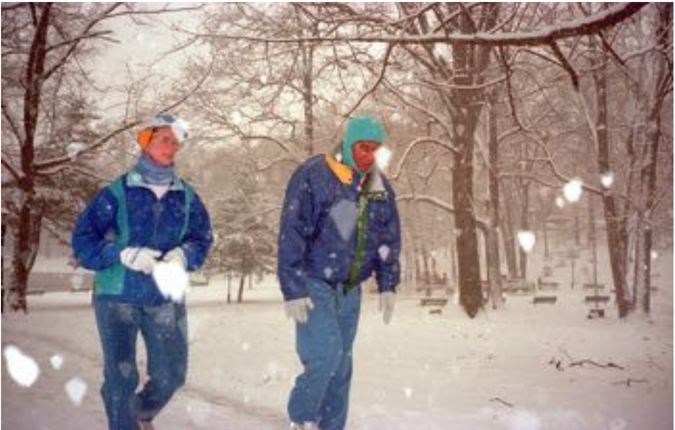
Figure 2 Guru with Nishtha at 2-Mile Race

The photos of Guru running in this article are from his participation in three 2-mile races in Goose Pond Park—two in 1995 and one in 1996. There are two seasons represented in these races: fall (including a snowfall in one of the races) and winter. On the Sri Chinmoy Reflections site it is recorded that Guru ran 3 official 2-mile races in the park between 1995 and 1996: 2 December 1995, 9 December 1995 and 10 February 1996. The December races were before we took off on our Christmas Trip to South Africa and the last race was when we returned.