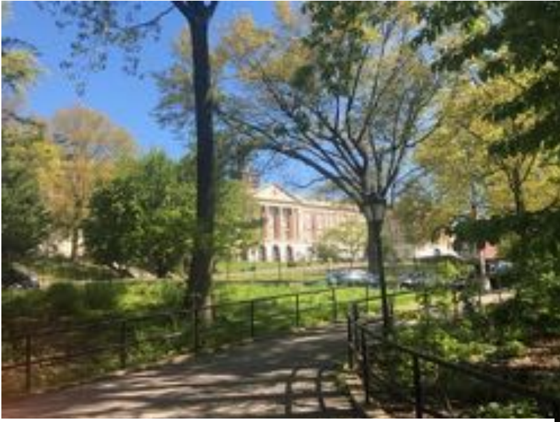
Figure 5 Jamaica High School as seen from Goose Pond Park