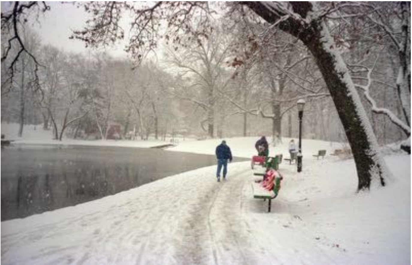
Figure 3 Guru running in the snow by the lake, with videographer on tricycle!

remaining Christmas Trips, but the 10 February race would remain his fastest time for those remaining races.